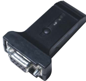
The Bluetooth dongle for use with the RDS2 and 3

Instead of using a normal on-off dongle, use the Bluetooth dongle supplied with the RDS2 or 3 to power on the SPAA05 NEX tool. As soon as the SPAA05 is turned on, the RDS will automatically make a connection and display the received heading.