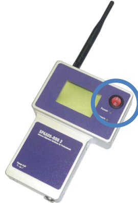
Just a power on button

The RDS is fitted with only one button, the power button. No navigation through software is needed and no settings have to be entered. Connect to the SPAA05 device and heading or tilt will immediately be displayed in real time.