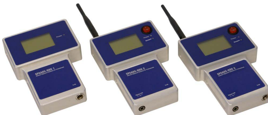
The three RDS models, from left to right: RDS1, RDS2 and RDS3

The RDS comes in three versions, with the same functionality. The RDS 1 can only connect via cable to the SPAA05 tool. The RDS 2 has Bluetooth built in to connect it with the tool, but lacks a cable connection and RDS 3 features both Bluetooth and cable connection.