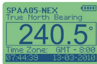
The RDS displaying heading information

The RDS will show the heading measured by the SPAA05-NEX tool. It also shows Grid or True North and current time and date.